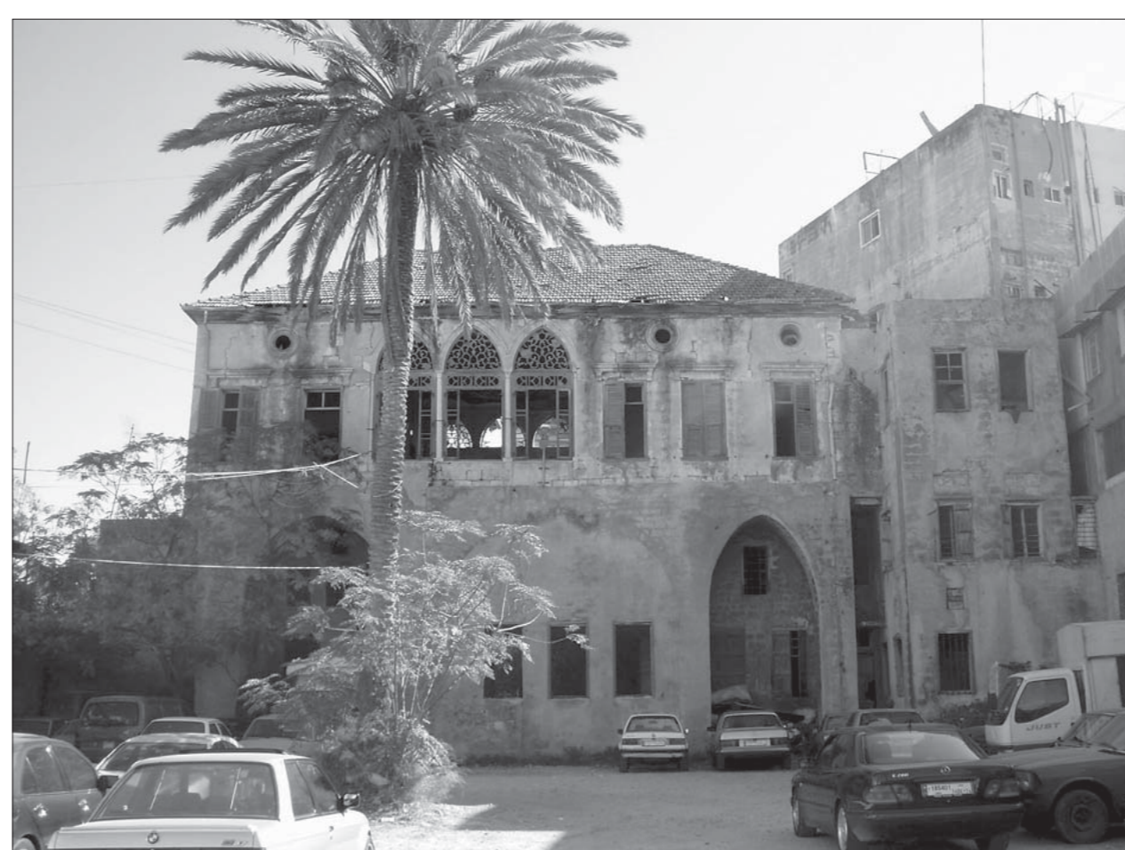
Bait Mughrabi in Tripoli al-Nouri