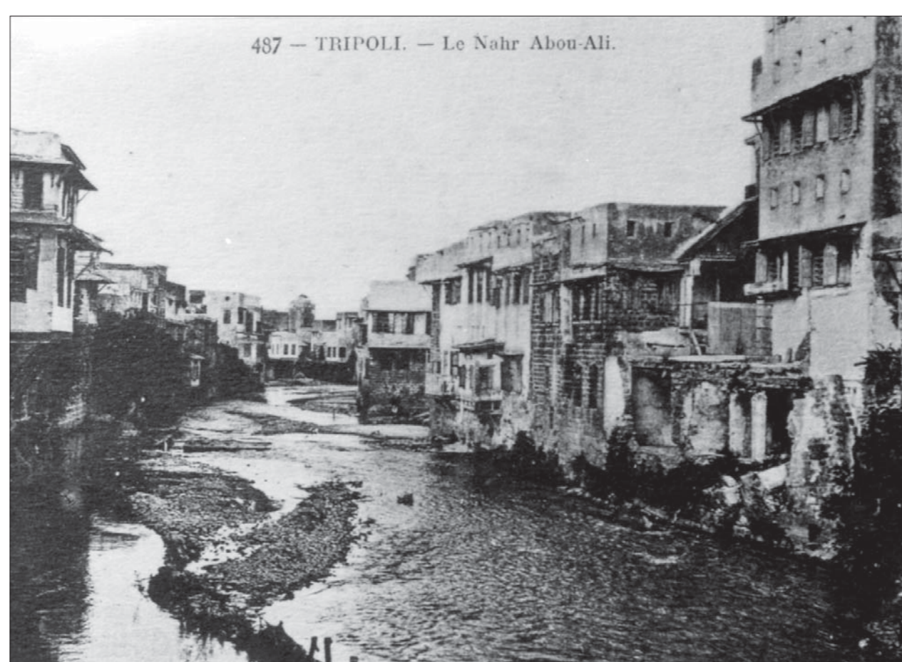
Residential buildings on Abou Ali river, late 19 th century (W.-D. Lemke)