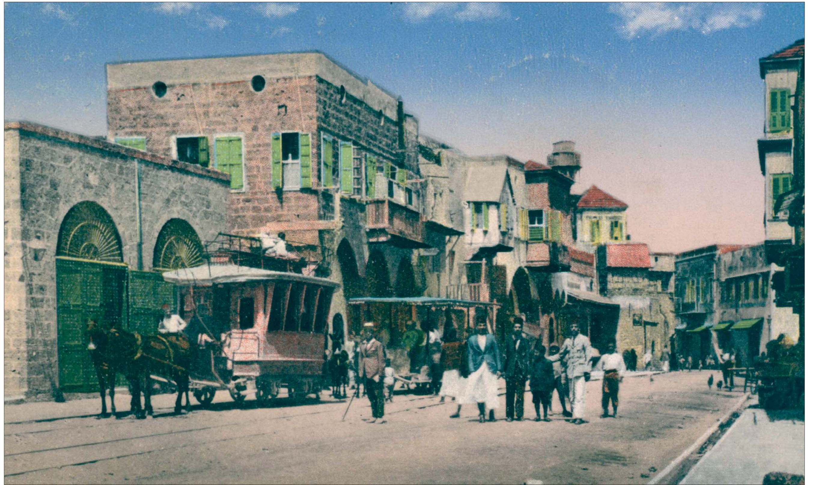
Horse tramway for public transports in Tripoli

As part of a cooperation between the Orient Institute Beirut, the Freie Universität, Berlin, the Technische Universität, Berlin, the Deutsches Archäologisches Institut, Berlin, the Aga Khan University, London and the Lebanese University, an interdisciplinary research group is looking at the urban fabric of Tripoli in the 19th and early 20th centuries under the combined aspects of material culture and social history. The project observes a micro-historical approach that takes local actors into consideration; it aims at analysing complex transformations of society and its urban spaces (Lebensräume) in Tripoli at a time that would have profound consequences for the entire Middle East. Tripoli is especially rich in sources, boasting an almost complete corpus of Ottoman court records (1666-1914) and a city centre with a great number of historical residential and commercial buildings still intact. Using these sources as a basis, changes in society and the concomitant processes of alteration in urban structure and architecture will