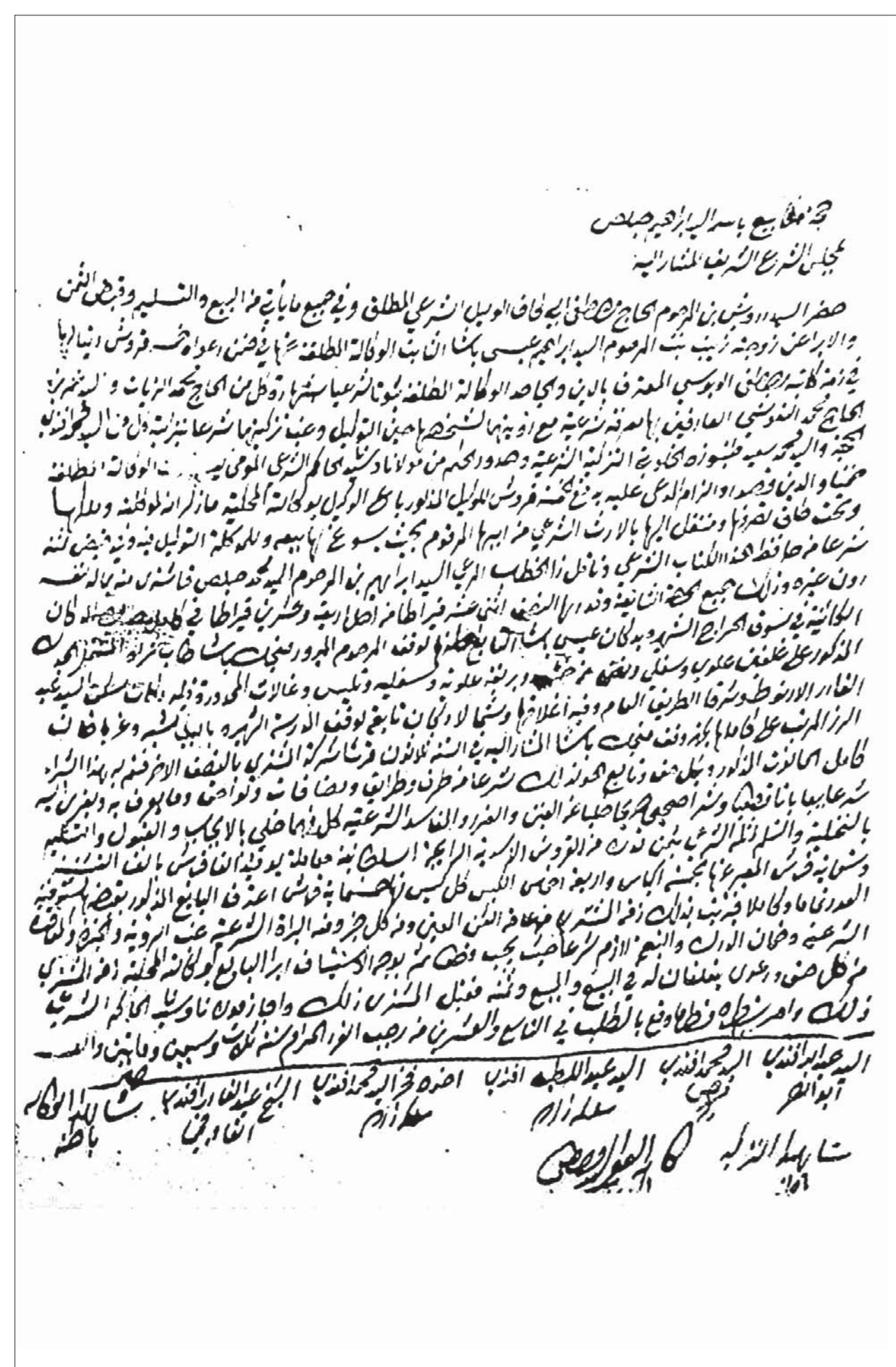
Court record out of volume 36 with reference to Suq Haraj

The Municipality of Tripoli supports the project and provides an office for the field campaigns.