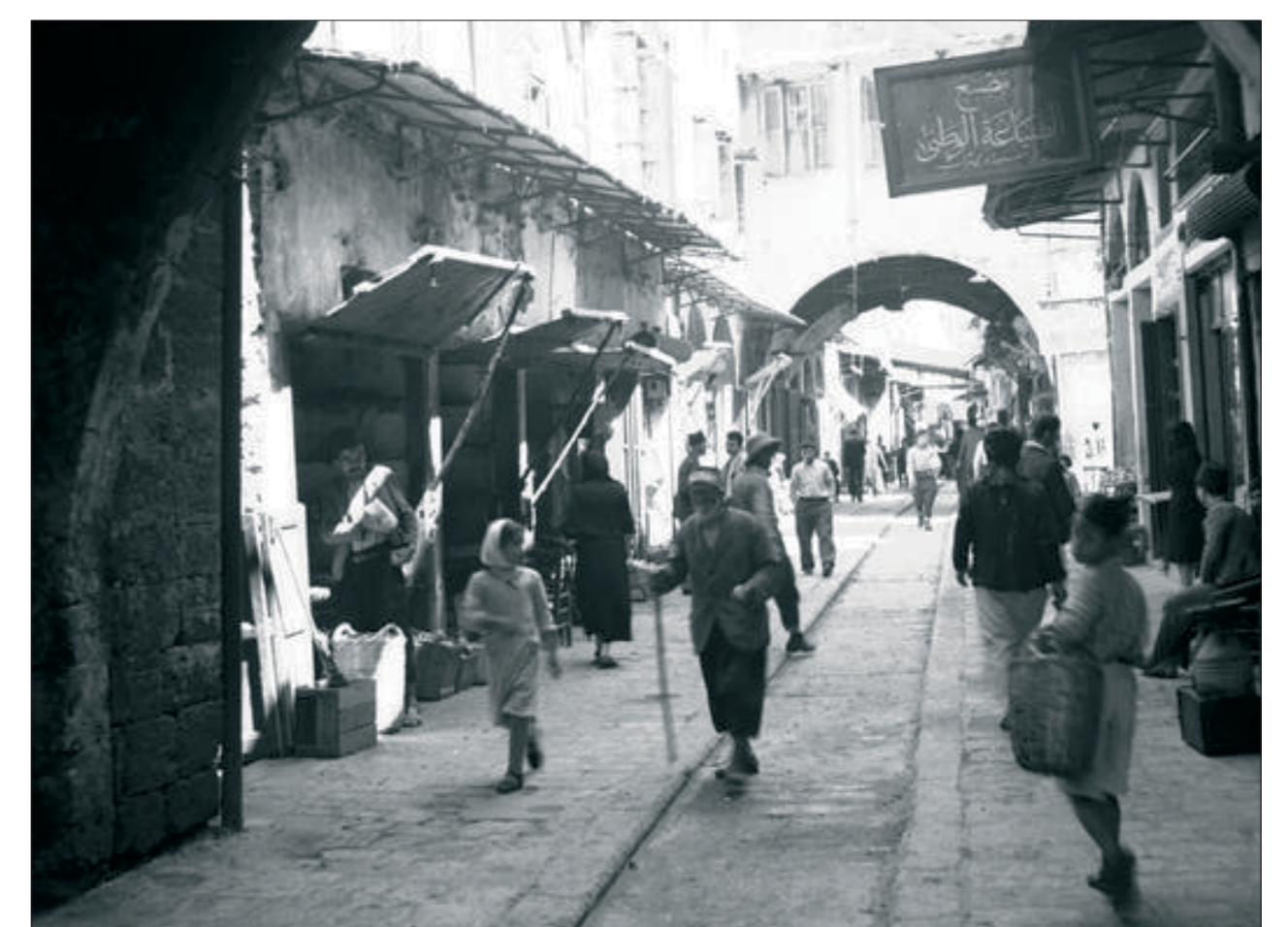
Suq street of Tripoli around 1900