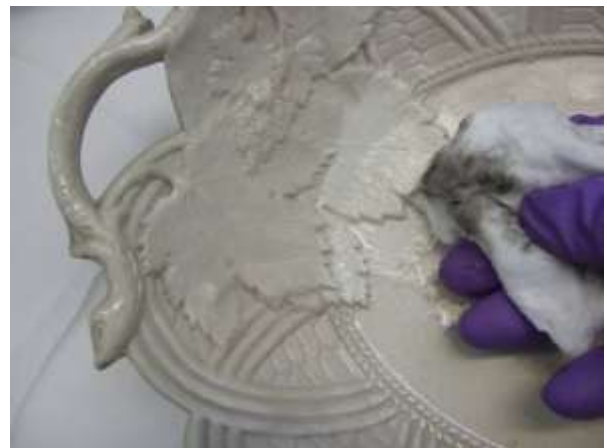
Fig. 2: Surface dirt accumulated while objects were in storage.

A large proportion of the objects in the new displays had been in storage for many years, even decades. This was sometimes reflected in the amount of surface dirt they had accumulated (Figs 2 and 3).