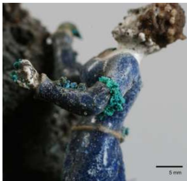
Fig. 1: Socoformacite efflorescence from cracks in the arm of a glass figure armed with an interior copper wire

Samples from contact corrosion have been found on a number of different objects where glass and metal corrode together in direct contact: enamel on copper, silver alloy mounted glass (a glass flute, a glass cabochon, a ruby glass box), a glass framed daguerreotype with brass mat, glass beads or balls in contact with wire, and glass figures with interior wire.