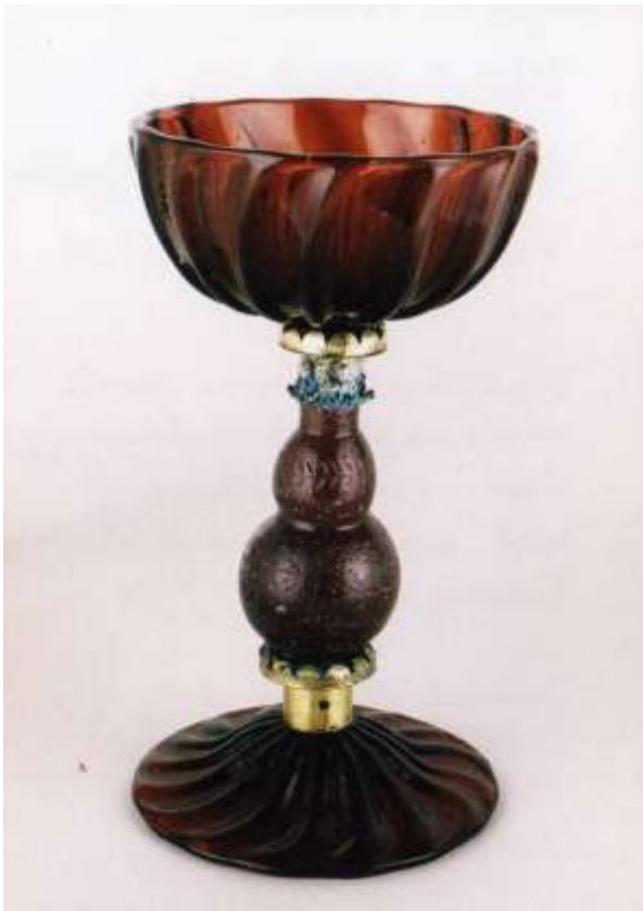
Fig. 2: Copper ruby glass cup munted with gilded silver with potassium containing corrosion in the contact zone

But are such joint corrosion products only found on copper alloys? Initial corrosion tests with lead in contact with a diluted soda solution precipitated a basic sodium lead carbonate, not basic lead carbonate (lead white, hydrocerussite) as one would expect [1]. A long term corrosion experiment with lead foil in contact with a soda glass sheet and a drop of water in between is currently running in our laboratory. Similar conditions could exist on leaded soda glass windows where there is a tiny gap between the metal and the glass. Any observations, analyses, or samples from historic leaded windows would be very helpful to my research!