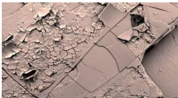
Scanning Electron Micrograph of a dried out gel layer, photo taken from www.glassac.eu

Please continue to e-mail all information regarding new papers, thesis, reports or conference proceedings related to glass alteration to laurianne.robinet@synchrotron-soleil.fr .