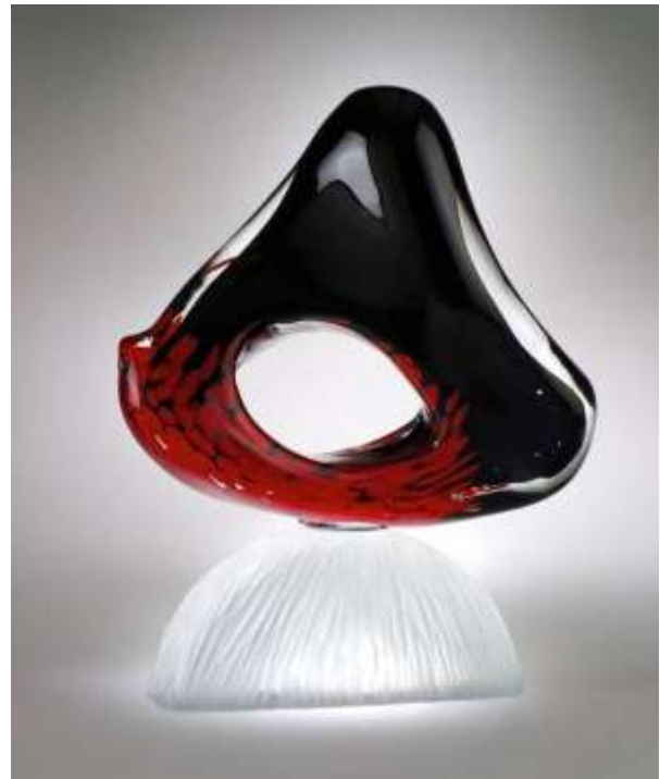
Fig. 2: Felekshan Onar: Derwish, hot glass, Turkey, 2008, © artist.

“Vorsicht Glas!” not only launches the immediate visual appeal of glass from the Middle East but also conveys its appreciation down to the present day. On the one hand, the exhibition communicates, through the biographies of individual glass objects from the museum collection, the path from production, to conservation, and finally to exhibition. On the other hand, contemporary glass artists savour the inherited production techniques and stylistic elements by innovative interpretations.