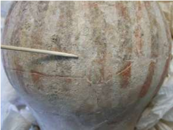
Fig. 4: Stick pointing to tissue over break edge, after blending-in

the pieces of tissue blended in with the background (Fig.4) and provided enough strength to allow handling.