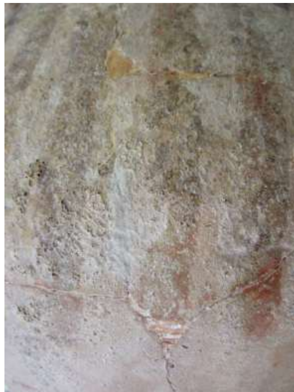
Fig. 3: Close-up of tissue over a join, before retouching to blend-in

the curved surfaces; it would also be less noticeable. In order to achieve a soft edge, the tissue was cut to the required shape by drawing the 'cutting' line with a fine sable brush dipped in water and teasing out the two pieces along the wet line, so that the fibres would be spread out at the edges. Such diffused edges blend in better with the background than a sharp blade cut, but, more importantly, the bonded area is effectively larger. Strategic places were chosen that would give the most support, including corners of several fragments, in order to keep the number and size of the tapes to the minimum.