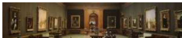
West Gallery of the Frick Collection

The lectures will cover issues related to the preservation of enamels, new scientific research, and technical and art historical studies. The panel discussion will feature experts who will discuss the conservation and analysis of enamels. The results from this discussion will be reviewed at the end of the meeting and will create a foundation for current methodology in these areas. A reception, coffee breaks, self-guided tour, and extended abstracts will be included in the event. Early registration through the website is advised (100 US$, 50 US$ for students) as the number of places is limited.