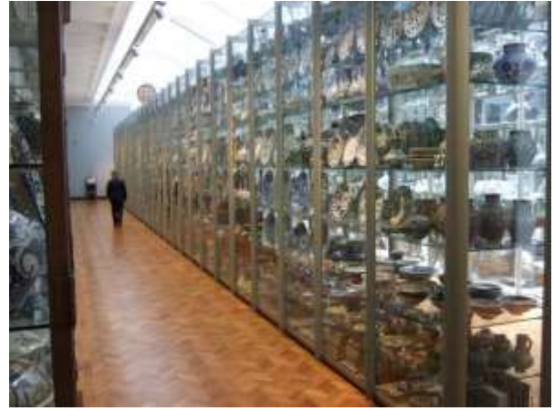
Fig. 4: View of one of the two larger galleries showing one of the central dense displays.

People from all continents were involved in this project; very fitting for a collection from all over the world. This is a unique resource for everyone interested in any type, style or period in the history of ceramics.