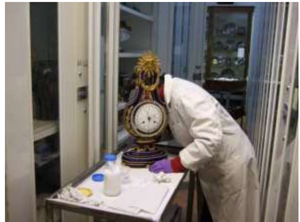
Fig. 1: Conservator with 'cleaning trolley' working between temporary storage cases.

volunteers. There would always be at least one conservator present to supervise and to answer questions. To save time, conservators also worked alongside the storage cases using trolleys.