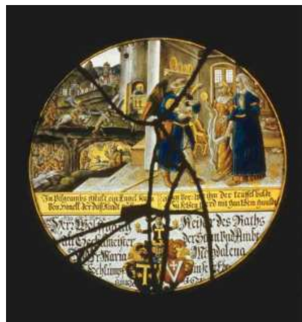
Fig 1: Swiss roundel: repaired with leads

The photos and text of the following case study was taken from the CONSTGLASS website.