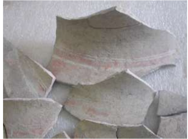
Fig. 3: After cleaning, red slip and white painted lines on the pot neck become visible

Ceramics from archaeological sites where there are high levels of sodium chloride in the ground should be tested for soluble salts. Ceramics with a high soluble salt content are desalinated by immersion in de-ionized water, the water being changed one to three times. After the ceramics have been cleaned, it is necessary to consolidate the edges of the sherds before reconstruction. This is done by diluting adhesive in conservation grade acetone and applying it onto the edges. Two or three applications are made. This strengthens the sherds, and prevents damage during assembly.