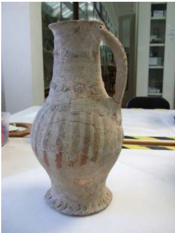
Fig. 2: Medieval jug showing break edges and fills.

The concept described above was adapted for a tall medieval jug [4] which had been excavated in fragments (V&A No. C.10-1965, Fig. 2). The body was very soft and porous and the fragments had been bonded, possibly with animal glue. The adhesive had shrunk on drying, pulling away from the break edges. Further the joins produced gave a very unsatisfactory hollow sound when tapped indicating poor join strength. The main structural support appeared to be provided by several plaster fills.