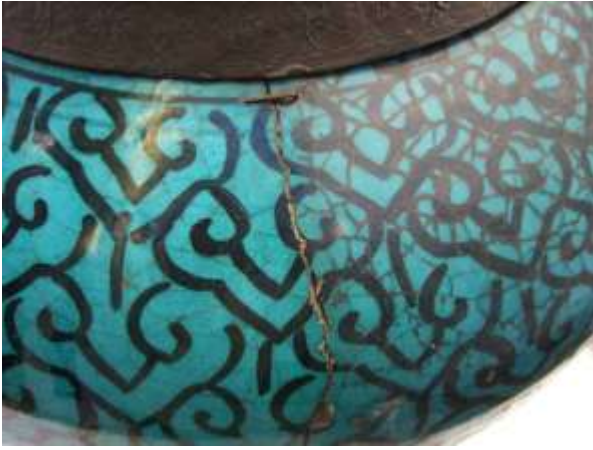
Fig. 3: A very porous fritware vase, had been used for the storage of greasy food. The dust settling on the glazed surface may have helped to extract some of the grease, which then became encrusted along the crazing pattern [right side]. The left side has been cleaned.

Other treatments included mechanical removal of excessive, discoloured and flaking retouching (with a scalpel). A few old joins gave way during handling, usually knobs or small parts which had been bonded with animal glue. These were re-bonded. Many old paper labels fell off and were re-attached.