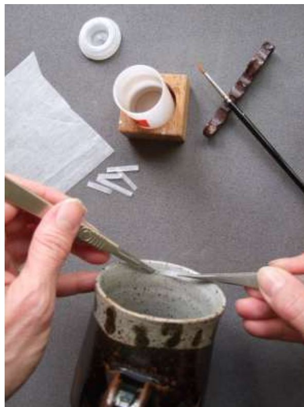
Fig. 1: Tweezers in right hand hold Bondina dipped in Paraloid B-72 solution. Scalpel in left hand to help place Bondina and then hold it down while the tweezers are pulled off.

Each conservator found their preferred method to apply the tapes. Figure 1 shows the conservator placing the thin strip of Bondina over the crack after the tape has been dipped in the Paraloid B-72 solution. An alternative is to hold the clean Bondina over the crack and to paint the Paraloid B-72 solution onto the Bondina with a soft brush.