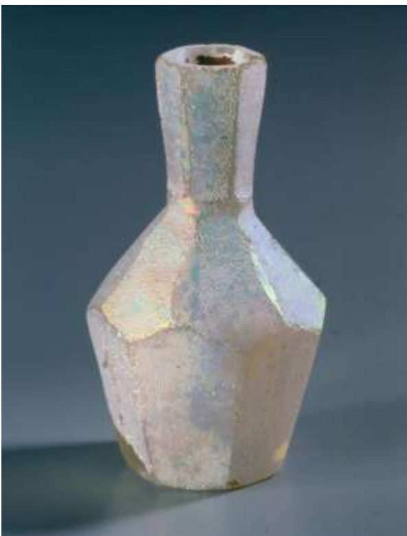
Fig. 1: Perfume flask, cut glass, Iran, 9 th – 10 th century, Museum of Islamic Art, Berlin, Inv. No. I. 49/63, © Staatliche Museen zu Berlin – Preußischer Kulturbesitz, photographer: G. Niedermeiser.

The temporary exhibition “Vorsicht Glas!” at the Museum of Islamic Art in Berlin focuses on the traditions and innovations of glassmakers and artists of the Middle East. The exhibition presents the artistic diversity of glass in form, colour, and decoration and their underlying manufacturing techniques. To accomplish this, sixty glass objects from the collection of the Museum of Islamic Art will be displayed alongside ten contemporary works from the partner gallery New Glass Art & Photography.