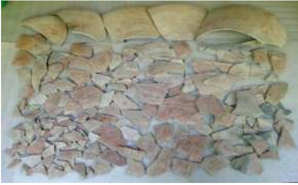
Fig 1 : A pot in 644 pieces (KTM05.10362, 10334)

Once a ceramic object has been cleaned, the information that this material can provide is lost. Ceramics from the Koh Ta Meas site are decorated with a red slip and a painted white stripe design. We tested the hardness of the ceramics by scratching the surface with a coin and could determine that they were made of under-fired earthenware and stoneware. Because of the red slip and white stripe design, we had to consider the most suitable cleaning technique before continuing.