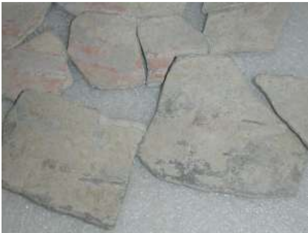
Fig. 2: Sherds before cleaning

Once a ceramic object has been cleaned, the information that this material can provide is lost. Ceramics from the Koh Ta Meas site are decorated with a red slip and a painted white stripe design. We tested the hardness of the ceramics by scratching the surface with a coin and could determine that they were made of under-fired earthenware and stoneware. Because of the red slip and white stripe design, we had to consider the most suitable cleaning technique before continuing.