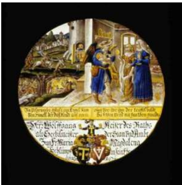
Fig 2: Swiss roundel: repaired with adhesive

The figures show a Swiss roundel, 1671, with scenes from the Life of St Francis (Burrell Collection, Reg N°. 45/530).